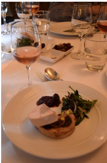
Degustation at nineteen 23

Le Delice De Bourgogne Cheese: Buller Fine Old Muscat, Beverford, Victoria