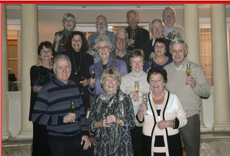
Members of the Metropolitan on the Society Weekend in the Blue Mountains 24, 25 and 26 May 2013

The Committee, at the first meeting of the Committee, 19 June 2013, will consider appointments to the honorary positions of Public Officer and Auditor.