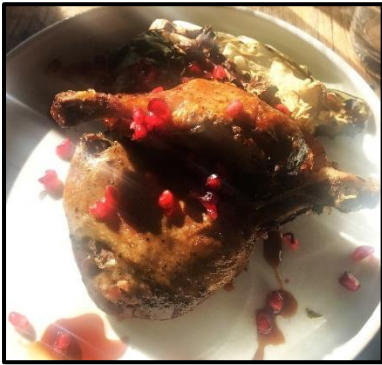
Slow roast duck leg, radicchio and roast onion, Pomegranate, apple balsamic