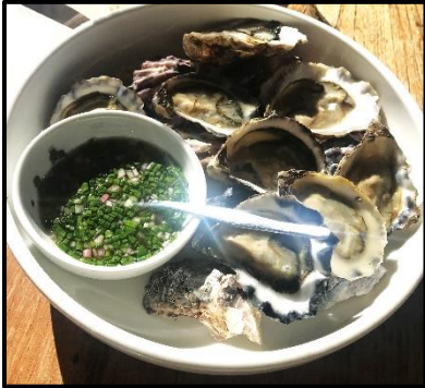
Freshly shucked oysters with Chardonnay vinegar dressing