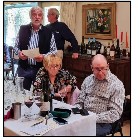
A lively discussion among the guys regarding the wines served.