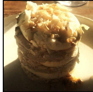
Potato, mushroom and leek tart, with goat's and hazelnuts